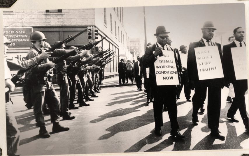
Sanitation Workers' Strike - Feb. 1968

The city of Memphis is known for the blues and BBQ, a place where people from all over come to have a great time. It also has a powerful place in both the Civil Rights Movement and the Labor Movement. The 1968 Sanitation Workers Strike is remembered as the last public action supported by Dr. Martin Luther King Jr and proved to be a catalyst that led to greater economic mobility for Black workers. Join us in this historic city as we harness that energy and share ideas to accelerate the march toward an equitable workforce.